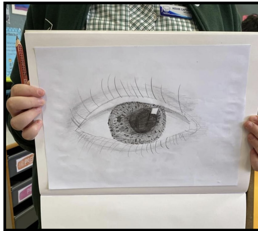
By Holly 5/6D