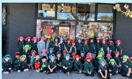
Above: Prep cohort during their walk around the community in Term 2.

Reading and Viewing: This term the reading comprehension strategies we are focusing on are summarising and questioning. Students will also continue to build on their rapidly developing decoding skills, further extending their love and enjoyment of reading. A reminder that Tuesday is the day that take home books are changed in Prep . Thank you to all the families who spend time reading with their children at home. Your support is an invaluable part of your child's learning. Listening to your child read and reading with and to your child provides them with an opportunity to practise the skills they learn at school.